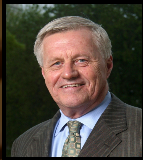
Ranking Member: Collin C. Peterson (D-MN)