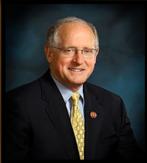
Chairman: K. Michael Conaway (R-TX)