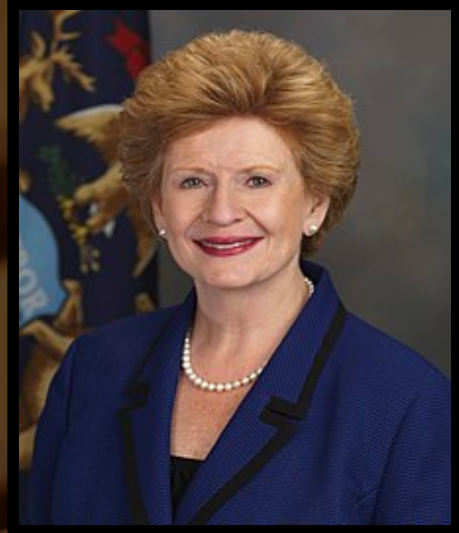
Ranking Member: Debbie Stabenow (D-MI)

U.S. Senate Committee on Agriculture, Nutrition & Forestry