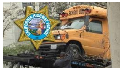
CHP Ignores School Bus Drivers' Concerns