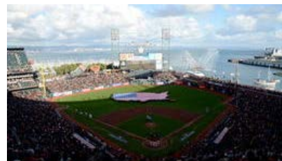
Rain To Clear For World Series Game