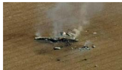
Bodies Still Not Recovered From Byron Plane Crash